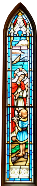
Jesus and Boy with Loaves and Fishes, Dunham Chapel

The services unfolds in our beautiful Dunham Chapel. We are surrounded by stained glass windows depicting the story of Jesus. And we share the Lord’s Supper every week. Worshipers note how formative it is to their faith to partake of both Word and Sacrament each week. The intimacy of the Chapel creates a cozy, meditative feel to the morning. With piano, organ, special solos and personal prayers, Chapel Communion richly worships our Triune God.